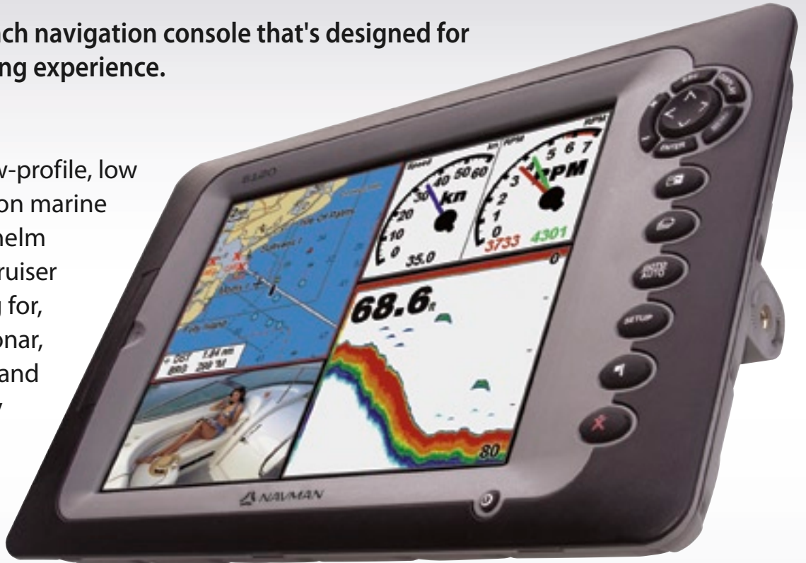
Chart. Navman's 32 MB chart gets you started for global navigation, or install C-Map's NT MAX™ technology for detailed chart data, value-added port info and land detail.

The 8120 is the low-profile, low power multifunction marine computer or datahelm every fisherman, cruiser and sailor is calling for, integrating GPS, sonar, fuel management and video functionality into a daylight viewable high-resolution screen.